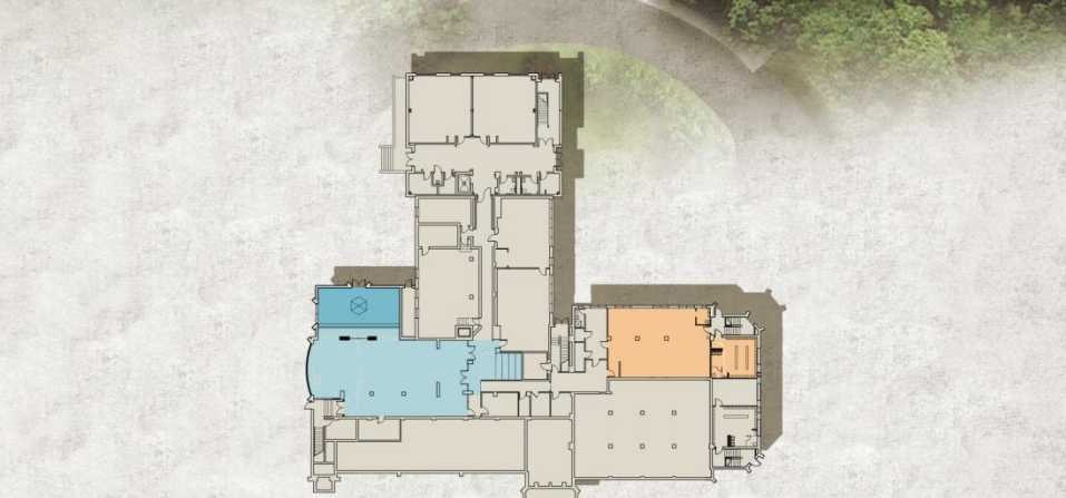
Proposed Lower Level Floor Plan: 1" = 20'-0"