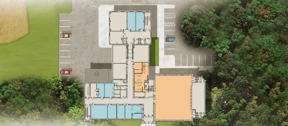
Proposed First Floor Plan: 1" = 20'-0"